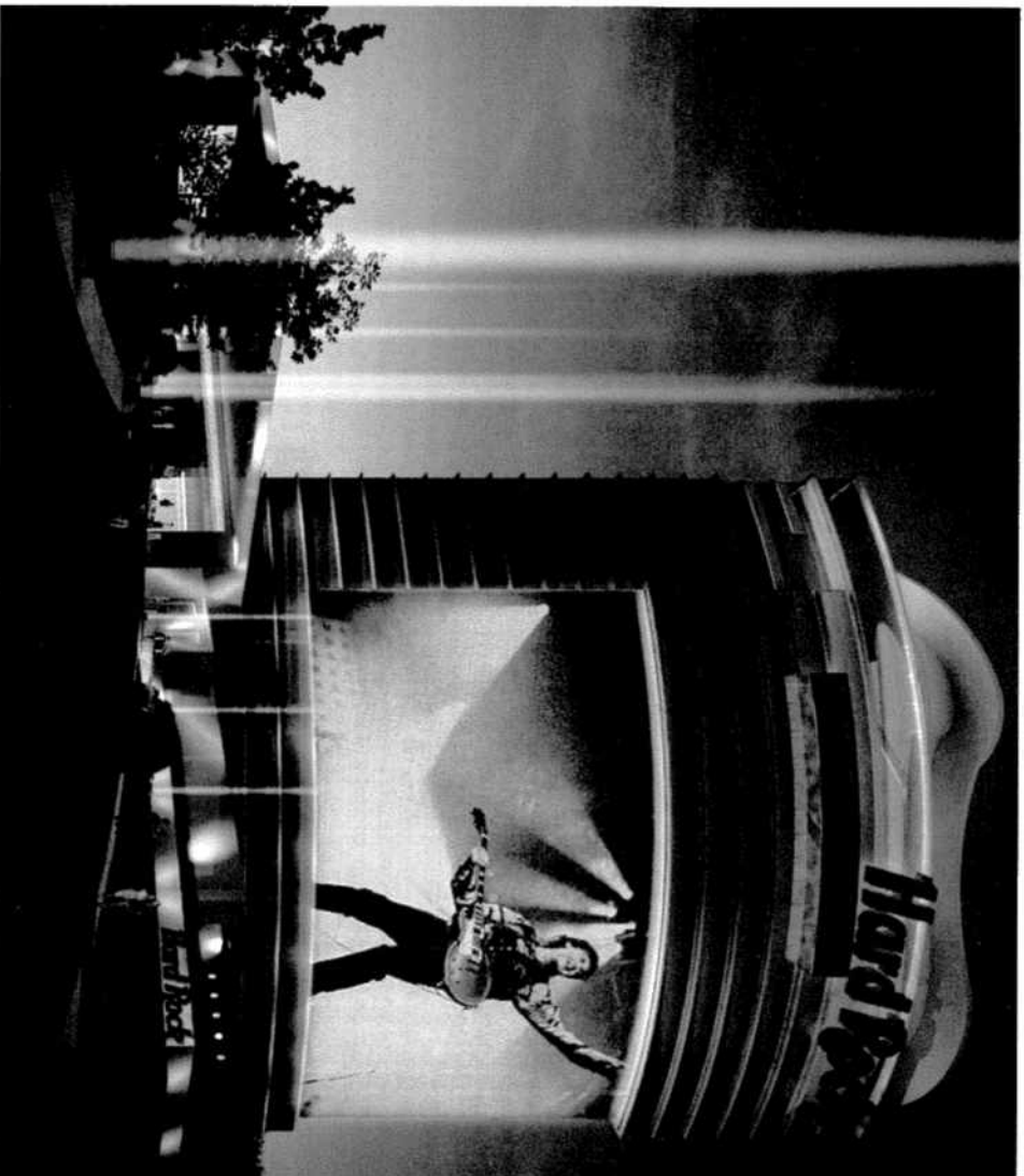
table games and slot machines. Additional amenities will include a pool and deck for lounging and entertainment, a Rock Spa for relaxing and detoxing, and a Rock Shop, where guests can check out the brand's authentic

It will boast more than 600 guestrooms, including a variety of suites such as the brand's Rock Star Suites, which are tailored and customised for the rock star at heart. The new location will also feature a Hard Rock Casino providing a Vegas-style gambling experience with a variety of options of