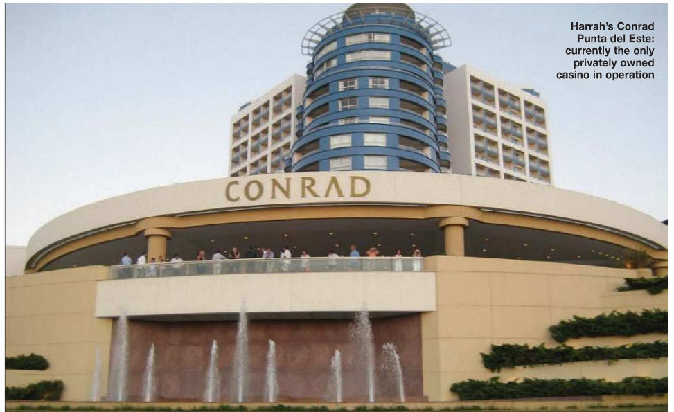
Harrah's Conrad Punta del Este: currently the only privately owned casino in operation

The government may also allow investors to